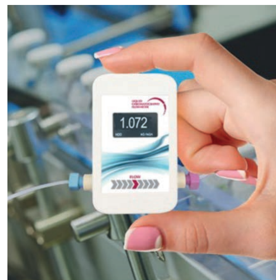
Figure 2: Compact non invasive flowmeter

Use of a non-invasive flowmeter for the tasks performed by an HPLC/uHPLC Service Engineer offers numerous advantages compared to using traditional gravimetric or volumetric test methods. The biggest benefit is that these new generation non-invasive flowmeters reduce needed time for completion of the on-site service job. In addition, these devices offer service engineers the possibility