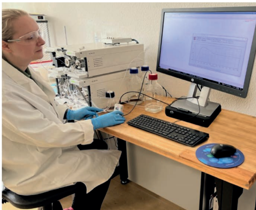
Figure 1: A new field service tool for HPLC / uHPLC

Precise monitoring, maintenance and troubleshooting play a vital role in ensuring the accuracy and repeatability of data from HPLC/uHPLC systems. Operating for extended periods of time and expected to deliver a stream of solvents not only at a constant rate, but at an exact rate selected by the user, solvent delivery pumps are core to any HPLC/uHPLC system.